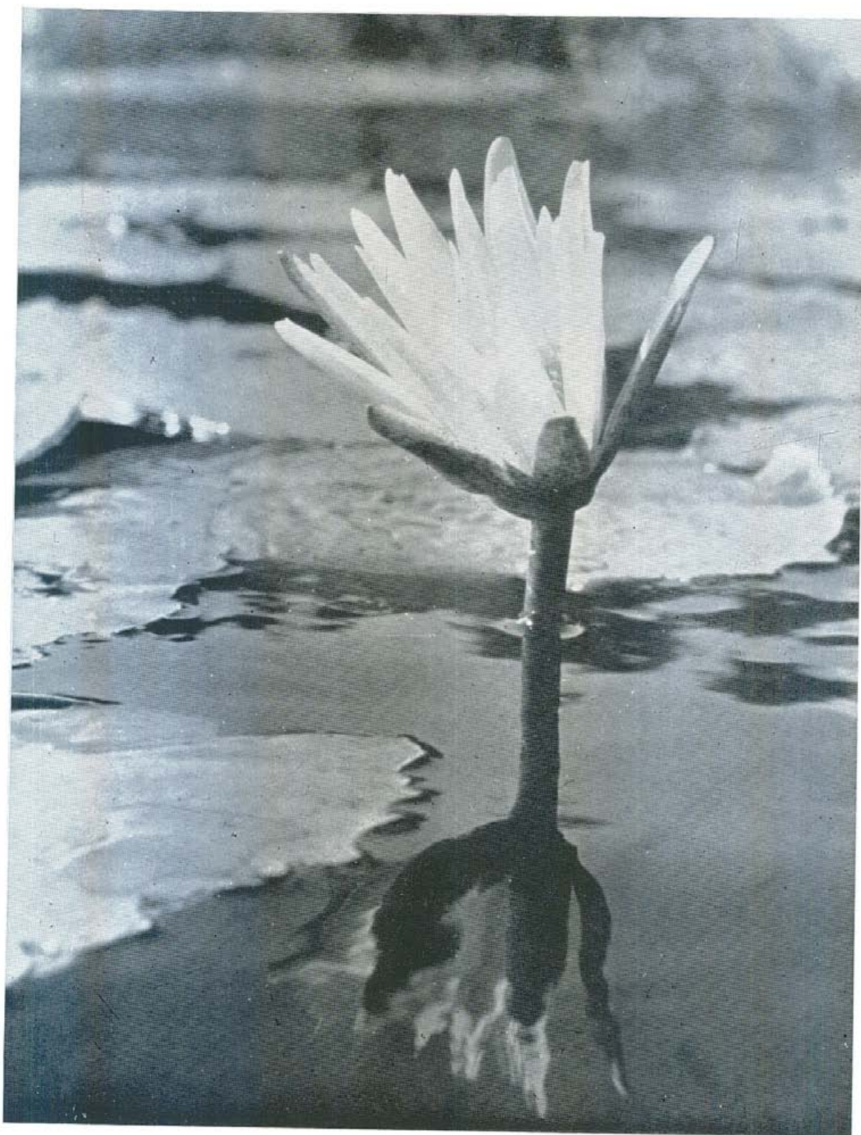
Fig. 5. Flower of Nymphaea ampla .