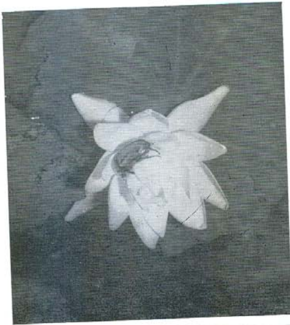
Fig. 3. Flower of Nymphaea rudgeana with the beetle Cyclocephala castanea on the petals.

set seed freely, showing that N. rudgeana is self-compatible. It is probable that autogamy is the predominant form of pollination in N. rudgeana .