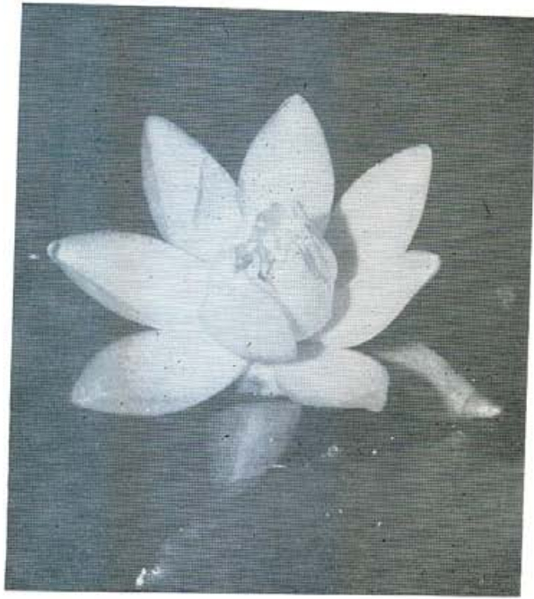
Fig. 1. Open flower of Nymphaea rudgeana .

two or three nights of opening, the flowers give off the same smell at equal intensity, but only on the second and third nights does the pollen appear to be released from the linear anthers. This suggests that the stigma is receptive on the first night. Thus, like V. amazonica , this species exhibits protogyny.