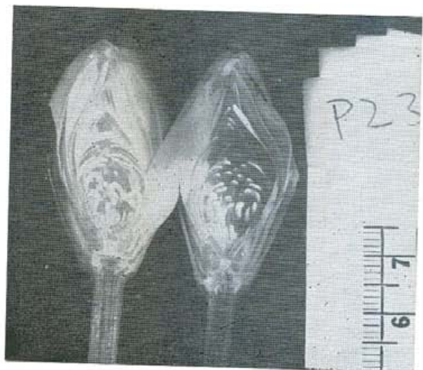
Fig. 2. Flower section of Nymphaea rudgeana , showing the inner recurved staminodes which are eaten by the beetles.

In the Manaus area, flowers which were bagged during their three days above water