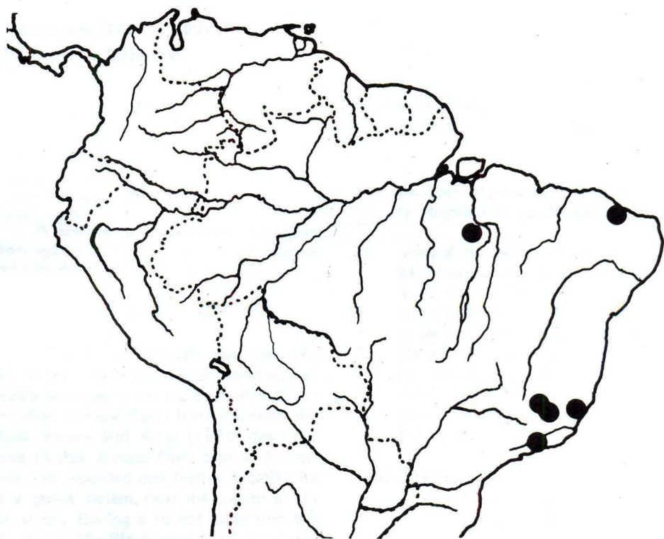
Map. I. Geographical distribution of Albardia furcata .

les, 1 female, armadilha de Luz (INPA). thout is one additional specimen without data in the possession of Dr. Habib-Fraiha of the Instituto Evandro Chagas, Belém, Pará.