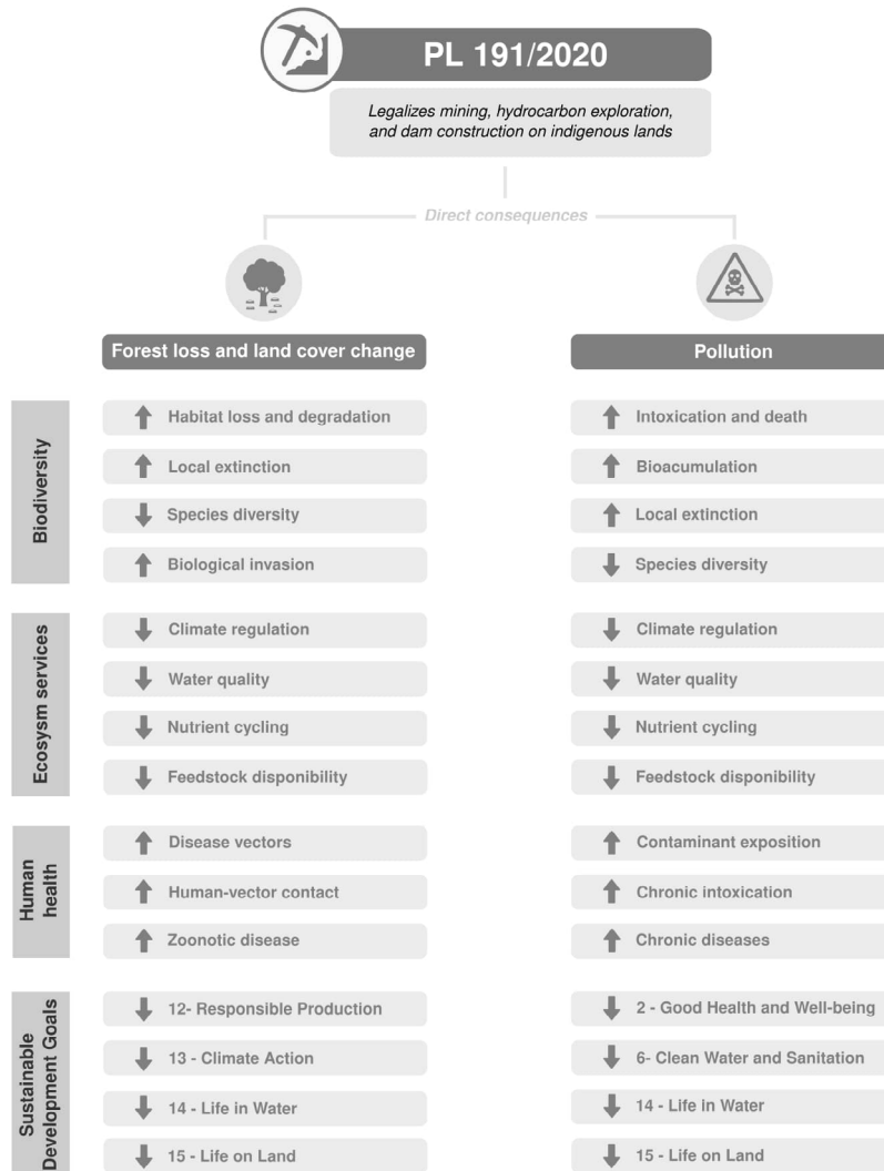
Figure 1. Flow chart summarizing the four points discussed. Arrows up or down indicate an increase or a decrease of components in relation to impacts of mining according to PL191/2020.

The exploitation of mineral resources represents a serious threat to biodiversity, as the increasing demand for metal ores and incentives for mining make it profitable for a high number of enterprises to operate in remote and preserved areas (Figure 1; Sonter et al. 2017). The mining activity promotes drastic losses of native vegetation cover both inside and outside the limits of the leased mining areas (Sonter et al. 2014a, b). Over the last 20 years, there was a significant increase in deforestation rates of primary forest in the Brazilian Amazon (Silva-Junior et al. 2020) due to two main causes: (i) establishment of mining infrastructure and associated