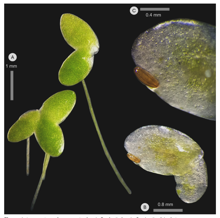
\textbf{Figure 1.} \textit{Lemna minuta}. \ \textbf{A} - \textit{vegetative fronds}; \ \textbf{B} - \textit{fertile fronds}; \ \textbf{C} - \textit{details of the fruit}.

Comments : Lemna minuta can be confused with L. valdiviana or L. aequinoctialis due to the great morphological simplicity of the group, with few distinctive characteristics between species. Lemna aequinoctialis can be easily distinguished from the others by the presence of three veins in the fronds, while L . minuta differs from L. valdiviana by rarely presenting a vein, when present it has one, inconspicuous and less than 1 mm long and having 2-3(-4) tied-fronds, while in L. valdiviana the vein is always present, conspicuous and greater than 1 mm in length, in addition to having 4(-10) tied-fronds (Pott and Cervi 1999; Pereira et al. 2015; Lourenço and Bove 2019; Pott and Lourenço 2024b; Table 1). Lemna minuta can be found co-occurring with the congener L. aequinoctialis , but also with other species of floating aquatic plants, such as Pistia stratiotes L. and Salvinia spp. in environments with anthropogenic impacts (Lourenço and Bove 2019).